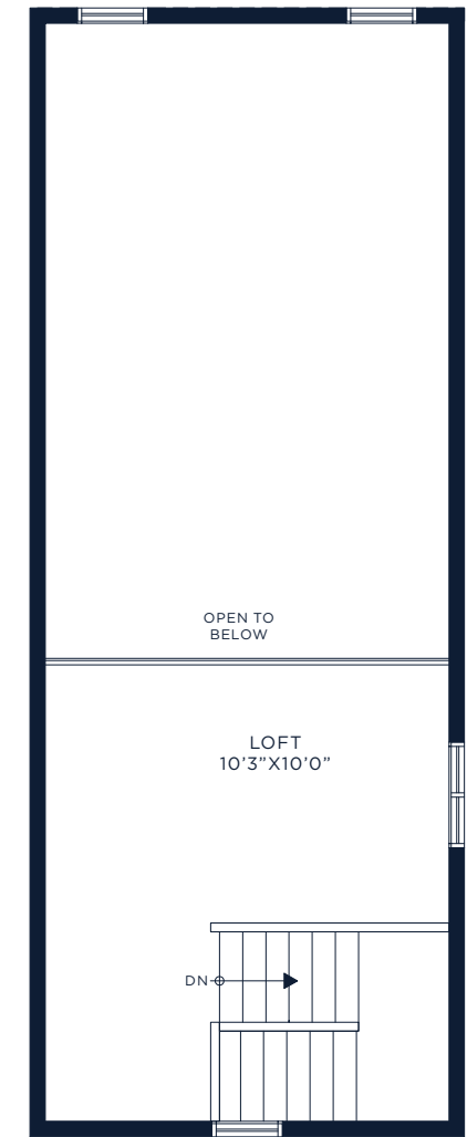
SECOND FLOOR 297 SQ.FT.